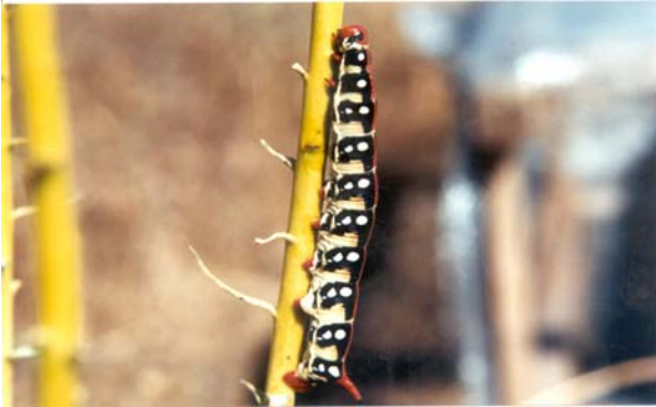
Hyles ( ) euphorbiae