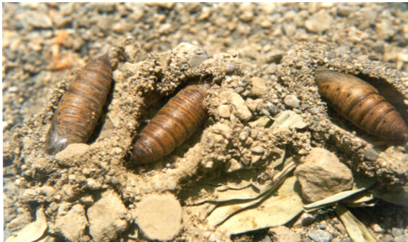
( ) Hyles euphorbiae