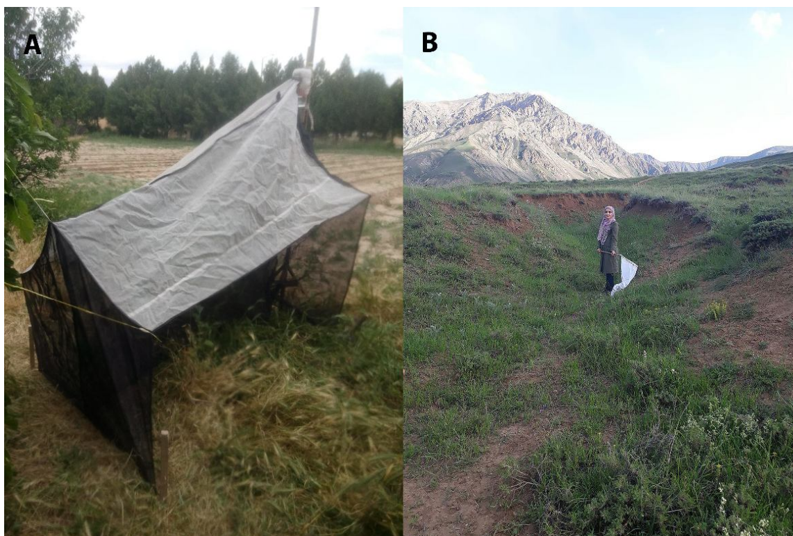
Figure 1 Habitats of collected specimens of Inostema species in the northwest of Iran, via a Malaise trap in Khosroshah (A) and a net in Marand (B).

Keys to species of this genus for many European species are given by Szelenyi (1938), European USSR (Kozlov, 1978), Fennoscandia Denmark (Buhl, 1999) and India (Mukerjee, 1981). Identification results were consequently confirmed by Dr. Peter Neerup Buhl (Natural History Museum of Denmark, University of Copenhagen). Photos were taken using a BK Lab System by Visionary Digital and also Zerene Stacker 1.04 (Zerene Systems LLC, Richland, Washington, USA) for focus stacking and assemblage and illustrations in the plates were done in Adobe Photoshop CS4® software.