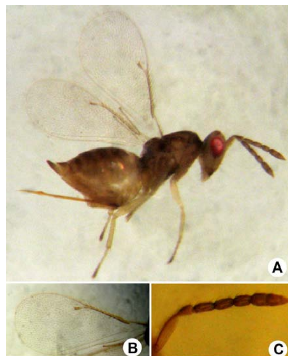
Figure 1 Aprostocetus deobensis : (A): Female in lateral view, (B): Fore wing, (C): Female antenna.

This species is reported for the first time from Iran (Guilan province: Daryasar, Kuyeh and Zardab-Mahalleh) and has previously been reported from France, Russia and Sweden (Noyes, 2014).