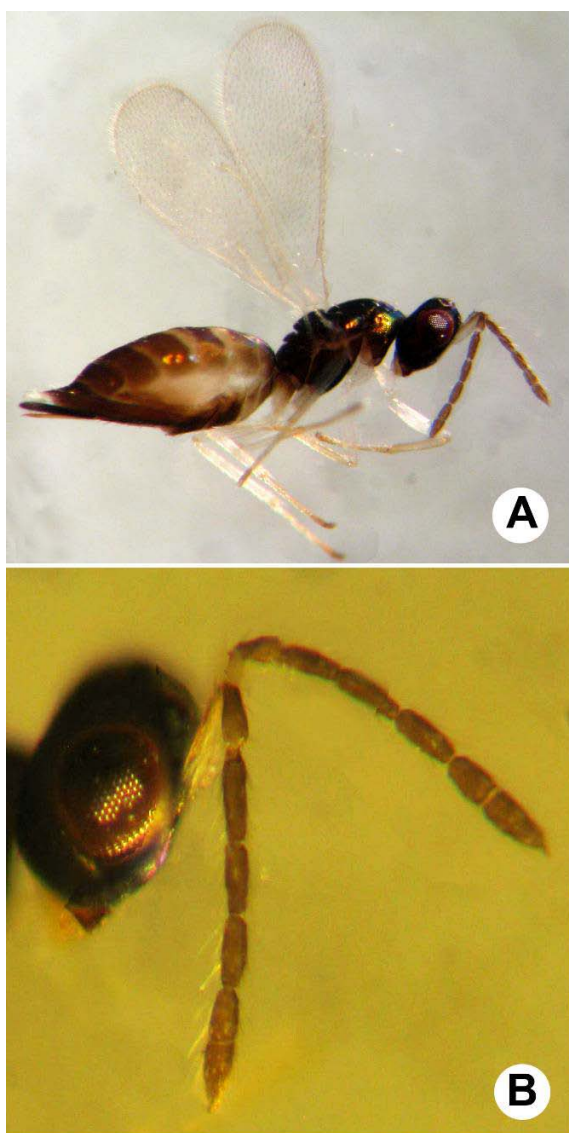
Figure 2 Aprostocetus mycerinus : (A): Female in lateral view, (B): Female antenna.

Diagnostic note: Body generally bronze-green with metallic reflection in some parts (Fig. 2A), antenna brown with yellow scape and pedicellus (Fig. 2B), fore, mid and hind coxae distally yellow; scape long and reaches to vertex, all funicular segments longer than broad (F1 about 3.5 times); excreted part of ovipositor 2.5 times length of hind tibia.