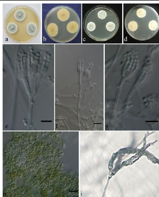
Fig. 3. Penicillium sizovae : a, b. Colony on MEA, c,d. Colony on CYA, e-g. Conidiophore, h. Conidia, i. Conidial head (Bar = 10 \mu m).