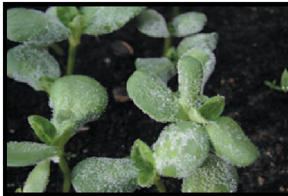
Fig.1. Sporulation of Plasmopara halstedii on Record (a sensitive sunflower cultivar).